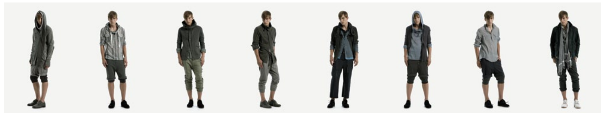
5 A 5 B 6 A 6 B 7 A 7 B 8 A 8 B