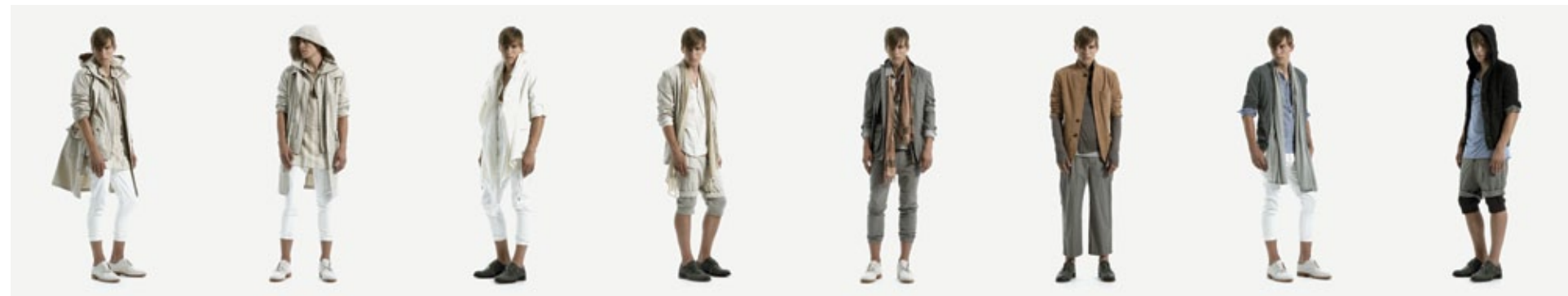
1 A 1 B 2 A 2 B 3 A 3 B 4 A 4 B

MK-089 JAXON LONG T (SEAFOAM) MP-069A DOCK SHORT (KELP) 13B MO-094 KELVIN 2 IN 1 JACKET (INNER) (ALGAE) MSW-101 FOSTER SWEATER (LT. GREY HEATHER) MP-064A DOCKERY SHORT (ALGAE) A-104 DELPHI SCARF (SEAWEED COMBO)